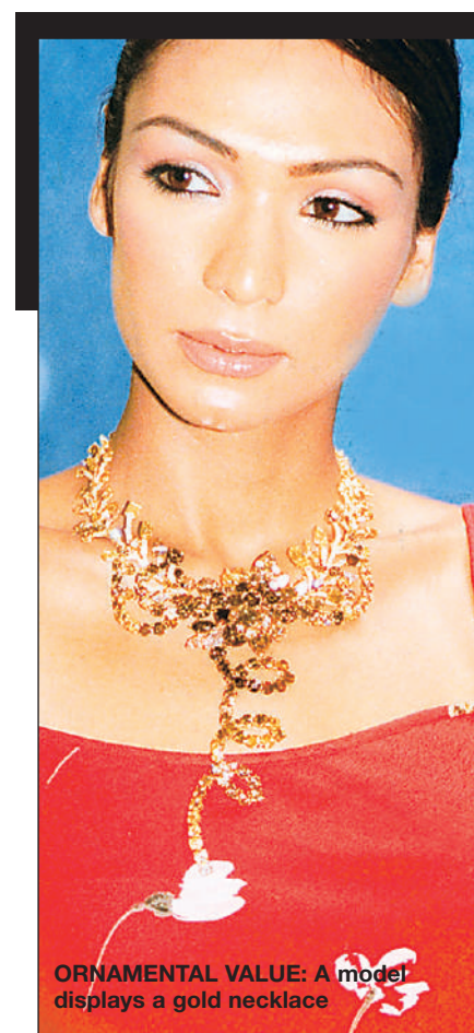
ORNAMENTAL VALUE: A model displays a gold necklace

Doing things at the right time makes all the difference. Which is why the concept of mahuraths is really popular — after all, well begun is half done, isn't it? Electional astrology gives us an insight into the concept of mahuraths . But here, we're going to tell you about why you should buy gold on